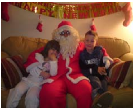
Father Christmas's grotto See inside for more photos