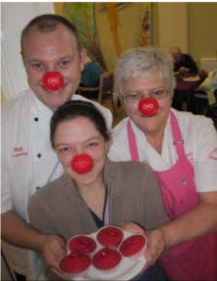
Red Nose Day Thank you for raising £50 !

The Friends are a registered charity. Donations given by Gift Aid allow the charity to claim tax back from the government. Please ask for a form.