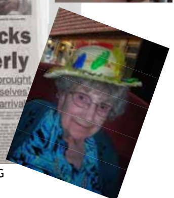
September Residents Holiday to Skegness